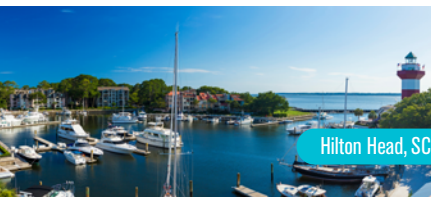
Hilton Head, SC