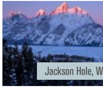
Jackson Hole, WY