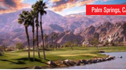
Palm Springs, CA