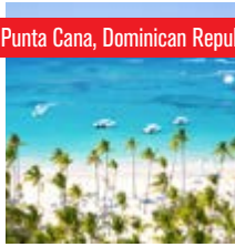
Punta Cana, Dominican Republic