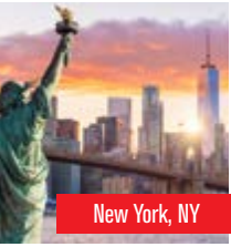
New York, NY

Ritz-Carlton Family Escape: six-day/five-night trip for four (2 adults/2 children under 18), accommodations at your choice of 27 Ritz-Carlton properties located within the 48 contiguous states