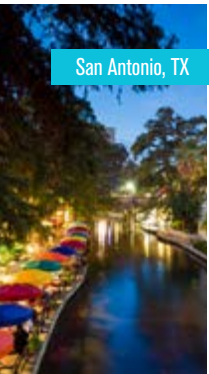
San Antonio, TX

Orlando, Florida Family Reward: four-day/three-night trip for four (2 adults/2 children under 18), accommodations at Disney's Coronado Springs Resort